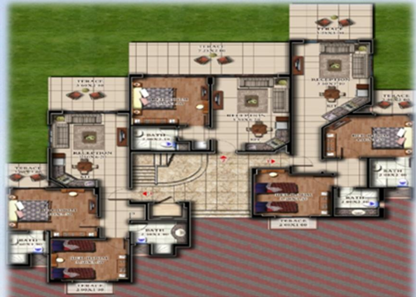
Type D Ground Floor

Unit 1: 98 sqm Unit 2: 66 sqm Unit 3: 95 sqm