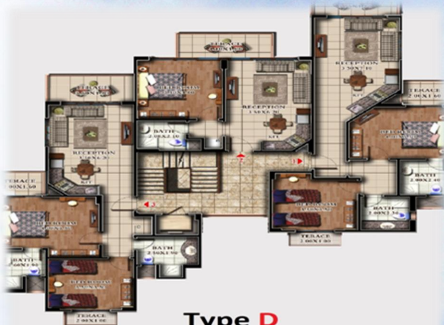
Type D 1st, 2nd and 3rd floor.

Unit 1: 98 sqm Unit 2: 66 sqm Unit 3: 95 sqm